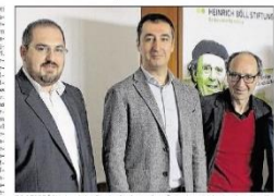
Die Lesung im Literaturcafé am Samstag erinnert an den Völkermord vor einem Jahrhundert