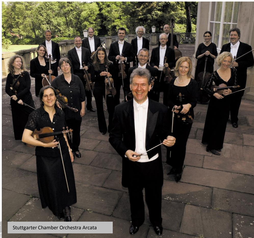
Stuttgarter Chamber Orchestra Arcata