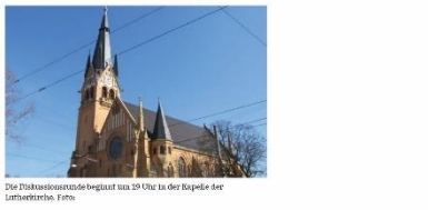
Die Diskussionsveranstaltung beginnt um 19 Uhr in der Kirche der Lutherkirche, Foto

Stn.DE Armenische Kulturtage in Bad Cannstatt Podiumsdiskussion in der Lutherkirche Von am 20. Oktober 2017 - 17:00 Uhr